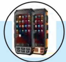
Mobile Data Terminal