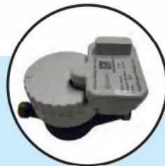
Water meter with RF Module