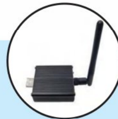
Mobile Data Collector