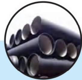
DUCTILE IRON PIPES