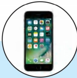
MOBILE WITH STS APP