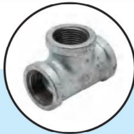
GALVANISED STEEL FITTINGS