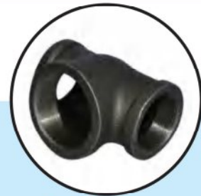
MILD STEEL FITTINGS