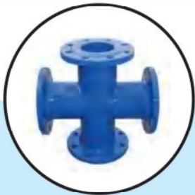
DUCTILE IRON FITTINGS